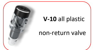
V-10 all plastic non-return valve