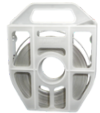
Colored Roll Band in Tote

* C07569 / C08569 tools for use on max 0.025" (0.63mm) thickness